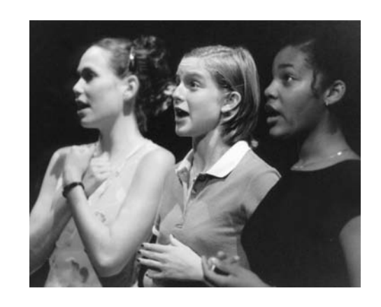
"I sing what I feel." - Ella Fitzgerald