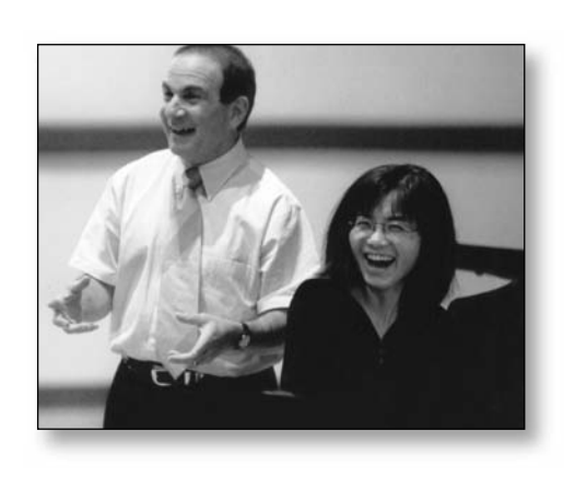
Song Fest 2008 www.songfest.us