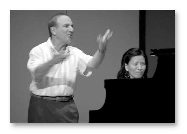
Song Fest 2009 www.songfest.us

"O what is it in me that makes me tremble so at voices? Surely whoever speaks to me in the right voice, him or her I shall follow."